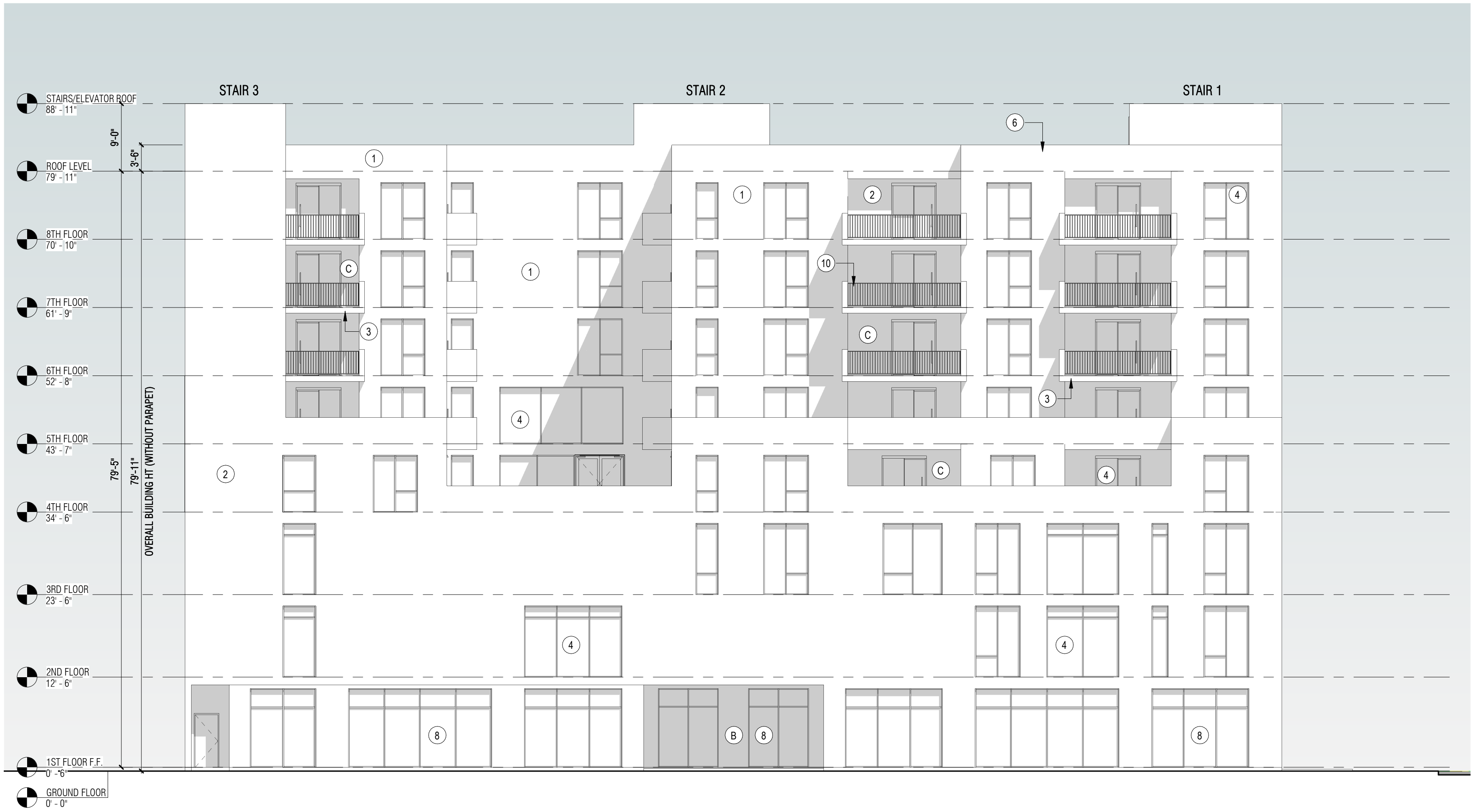
1 SOUTH ELEVATION - ATLANTIC BLVD. SCALE: 3/32" = 1'-0"